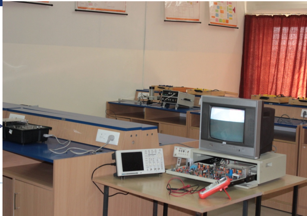
→ Communication Lab