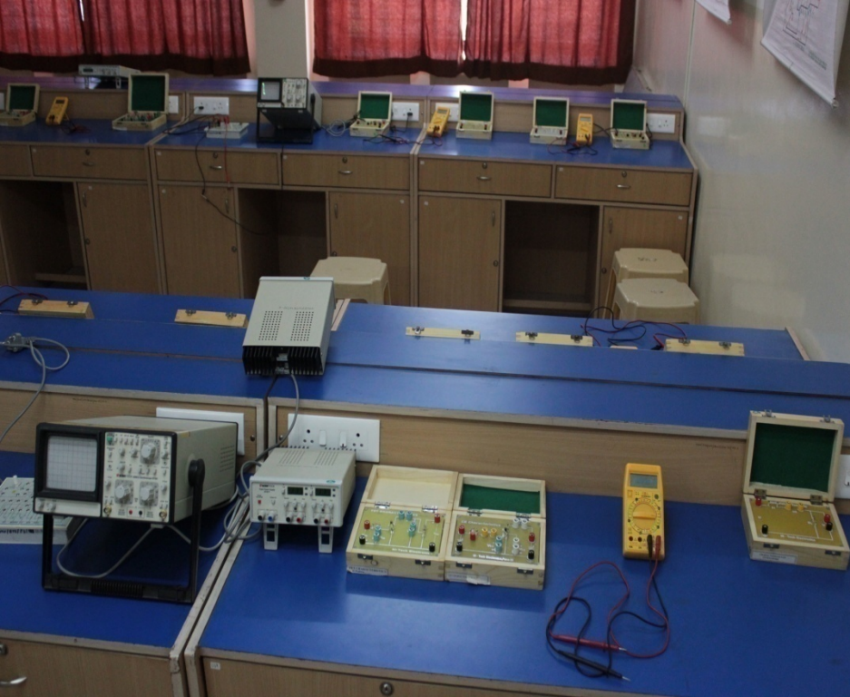
← Basic Electronics Lab