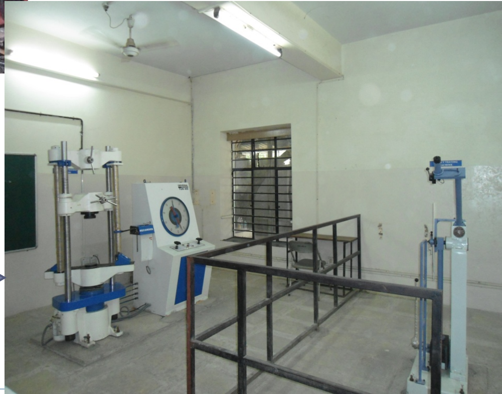
Materials Testing Lab